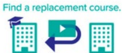
Video 3: Find a replacement course

To further expand these Transferology resources, the Transfer Transition Program at the University of Wisconsin-Madison (UW-Madison) has created instructions specific to seeing how courses can be evaluated at UW-Madison.