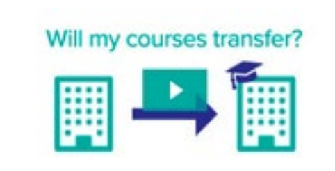
Video 2: Will my courses transfer?